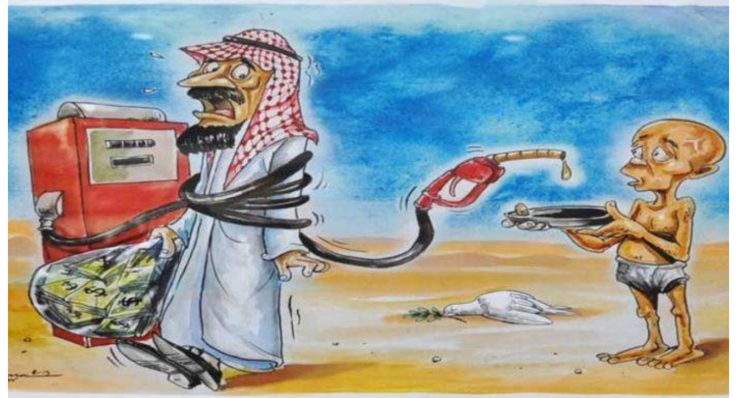
Indonesian cartoonist caricatures at the 13th Zagreb International Car Caricature Exhibition.